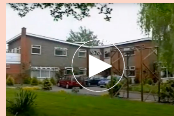
Murray lodge in the 1990s

Did you know? Murray Lodge featured in a BBC Inside Out documentary in the 90s.