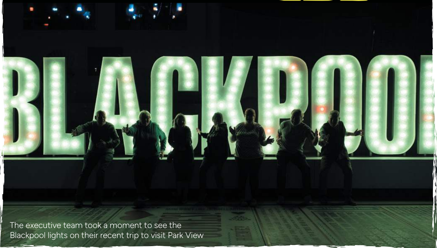
The executive team took a moment to see the Blackpool lights on their recent trip to visit Park View